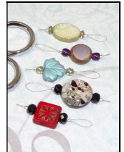
Lots of fantastic fobs and fun accessories!!! ~fobs, pins, threaders, needle minders, thread keeps, and more~

www.MyBigToeDesigns.com ~ PO Box 2237, Brenham, TX 77834 ~ 281-391-1415