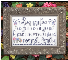
Normal Family ~whimsical designs!

This is a free design offered as a gift from My Big Toe Designs and your favorite needlework shop. It may not be kitted or sold. After printing a personal copy, please only duplicate with needle and thread. Please direct your stitching buddies to www.MyBigToeDesigns.com to download the freebie, and so they can view our other items available! Thank you and God bless!