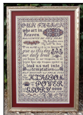
The Lord's Prayer ~large & stunning