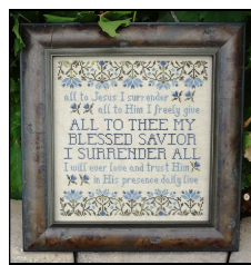
I Surrender All ~hymn series